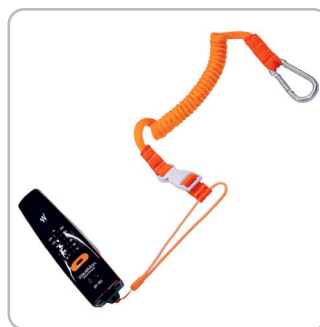
Safety cable Part # WWMA0001

Adjustable extension stick (73 cm / 28,74 ")