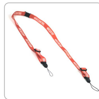
WaveMon Lanyard Part # WWMA0003