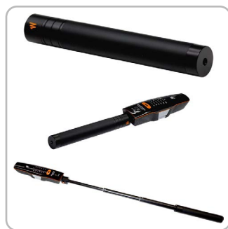
WaveStick Part # WWMA0002

Adjustable extension stick (73 cm / 28,74 ")